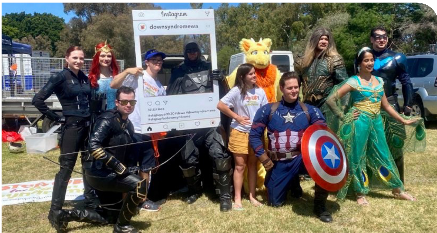
It was a super-powered Step UP! 2020.

Go to: www.steupfordownsyndrome.org.au for more information.