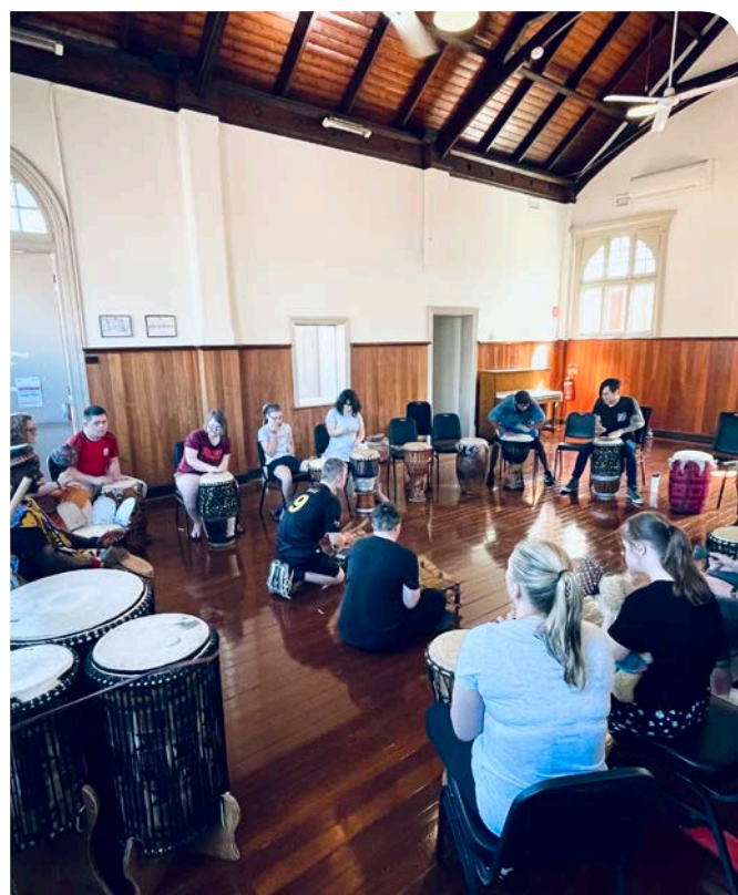
Friends for Life - African drumming