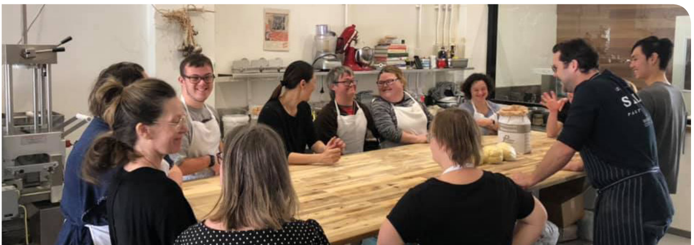
Pasta delight for Aim High Club! Pasta-making day.

As ever, THANK YOU to all our participating members and supports for contributing to and making this community a remarkable one. Our supports form an integral part of this service and I commend them all for their selflessness, generosity and dedication towards supporting our members.