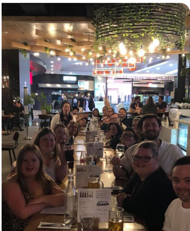
Some members of the Aim High Club out for dinner.