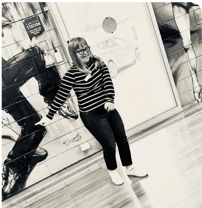
Friends for Life - dancing session at The Dance Collective