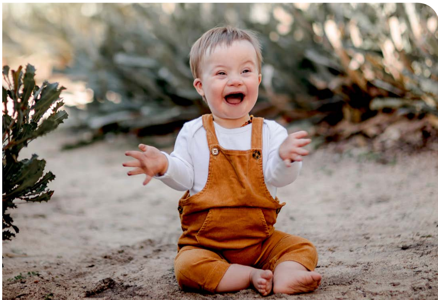
One of our Playgroup participants - who also featured in the 2021 DSWA fundraising calendar.