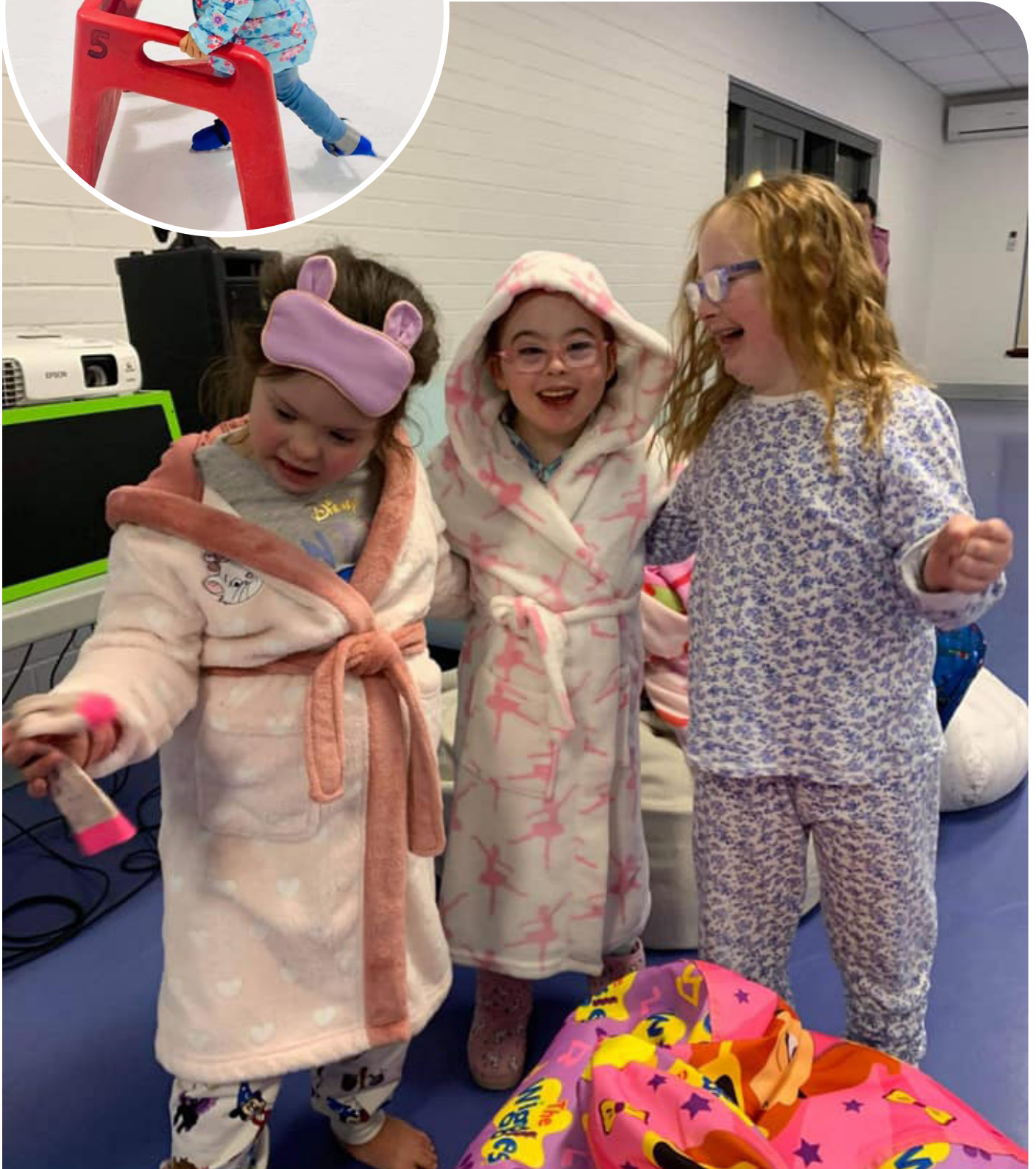
Girl power in their PJs.