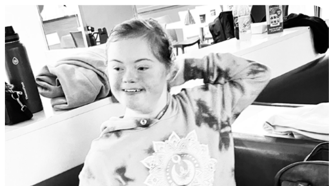
Friends for Life - bowling session