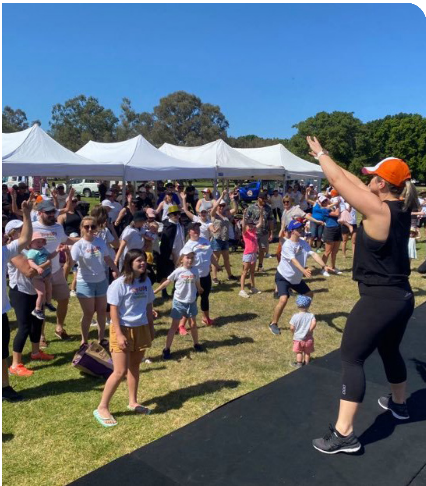
The crowd warming up before the walk.