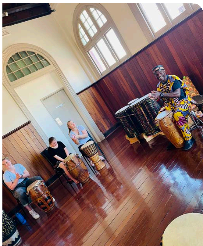
Friends for Life - African drumming