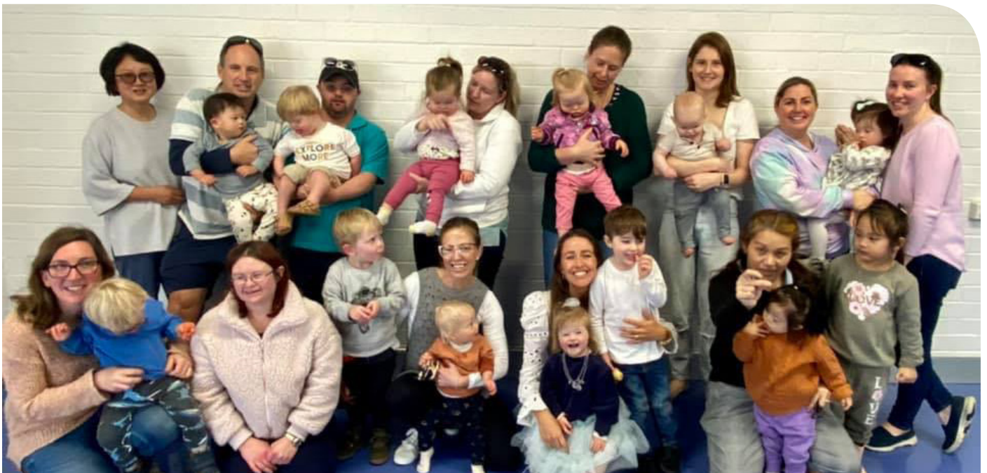
Playgroup families enjoying time together.