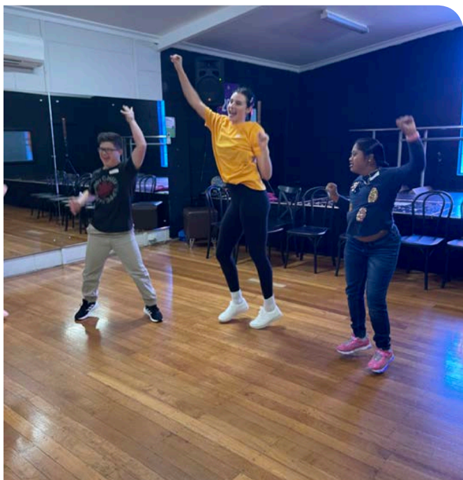
Friends for Life - dancing session at The Dance Collective

It has been rewarding to watch the friendships between members grow and see the teens trying new activities. Our members are developing social skills and independence skills while building their confidence through attending the events.